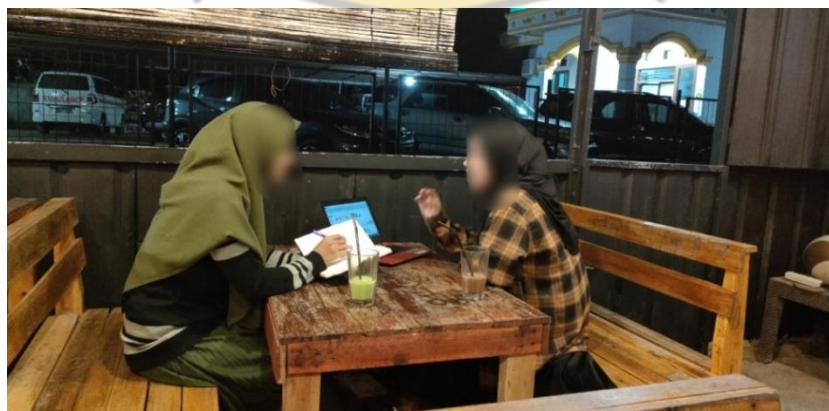
(Figure 3.4 The process watching videos and interviewed of video-based stimulated recall with participant 2 [session 1])