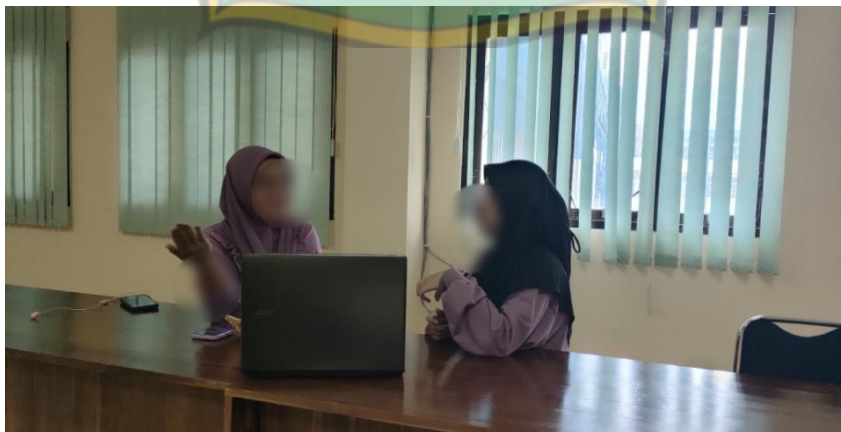
(Figure 3.6 The process of interviewed of video-based stimulated recall with participant 2 [session 2])