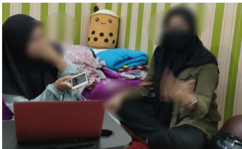
(Figure 3.8 The process watching videos and interviewed of video-based stimulated recall with participant 3)