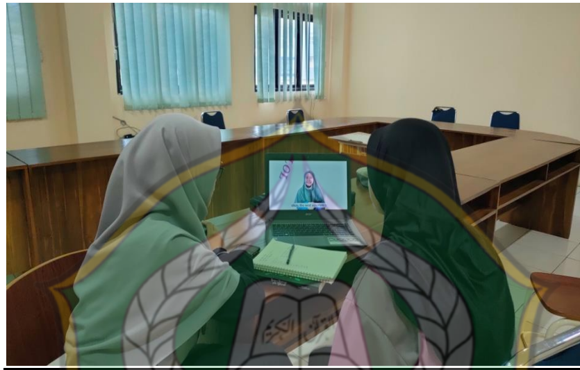
(Figure 3.1 The process of watching videos of online service learning to recall the memories of participant 1)