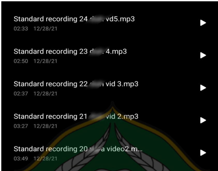
(Figure 3.9 Audio recordings of participant 3)