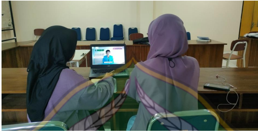
(Figure 3.5 The process of watching videos of online service learning to recall the memories of participant 2 [session 2])